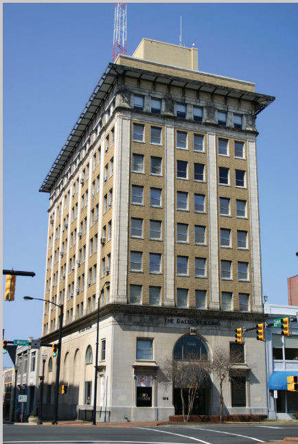
The historic Radio Building in High Point, NC.

allow us to bring more manufacturing in-house and allow us to serve our customers better. We hope to enhance our Quick Ship dining options. Stay tuned for more information in our next newsletter.